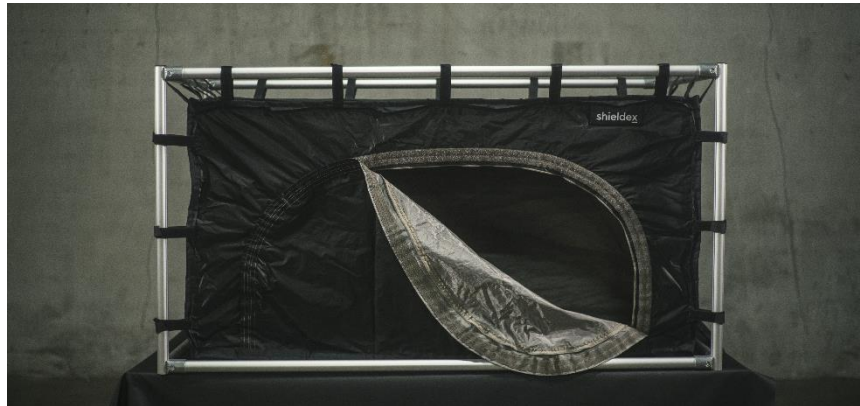
P-Series 2390 x 2390 x 2300mm