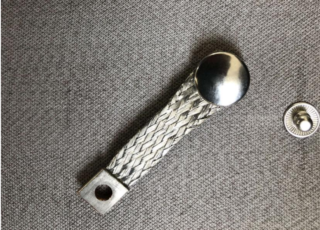
Picture 3: using textile rivets to establish electrical contact to the ground plane

The photo below shows an example, using rivets from a low cost textile riveting set along with a woven ground strap. The ground strap is clamped in between the two halves of the female rivet.