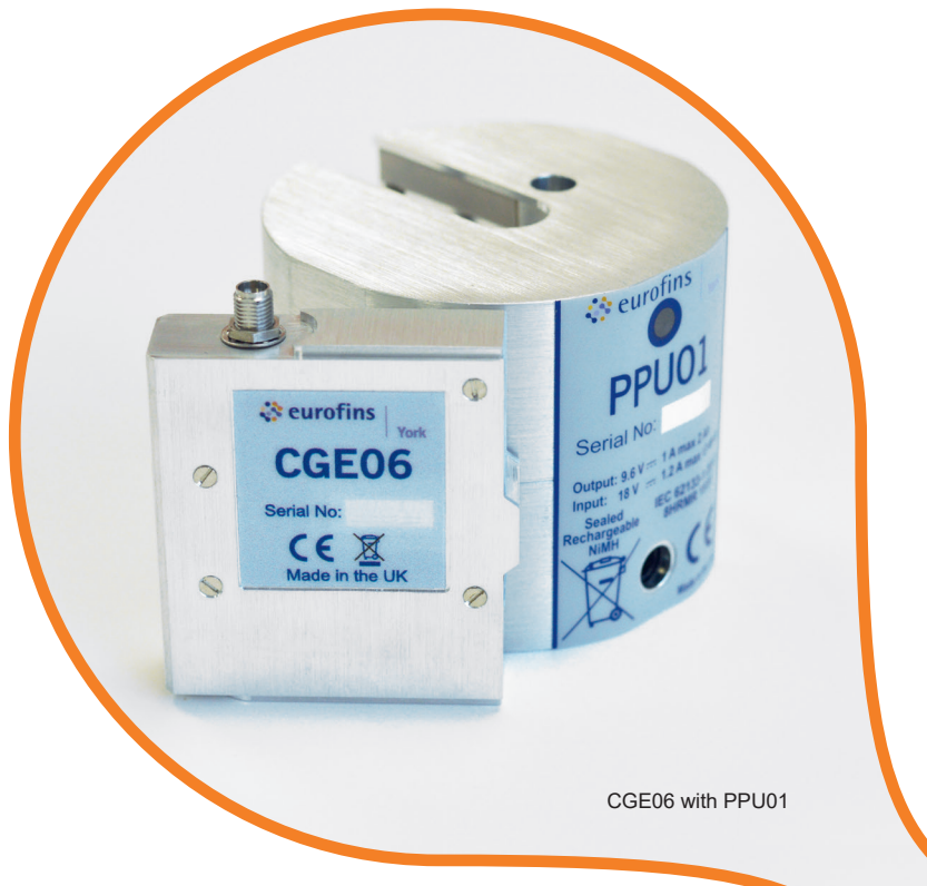
CGE06 with PPU01