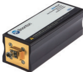
RTP4018-S/1 and RTP4118-S/1