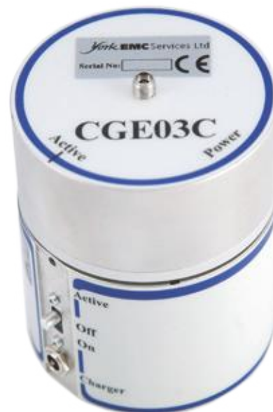
CGE03 with BP01 battery pack

The CGE03 harmonic steps can be switched between 900 MHz and 1 GHz as standard, allowing more frequency points to be measured than is possible with a fixed frequency source.