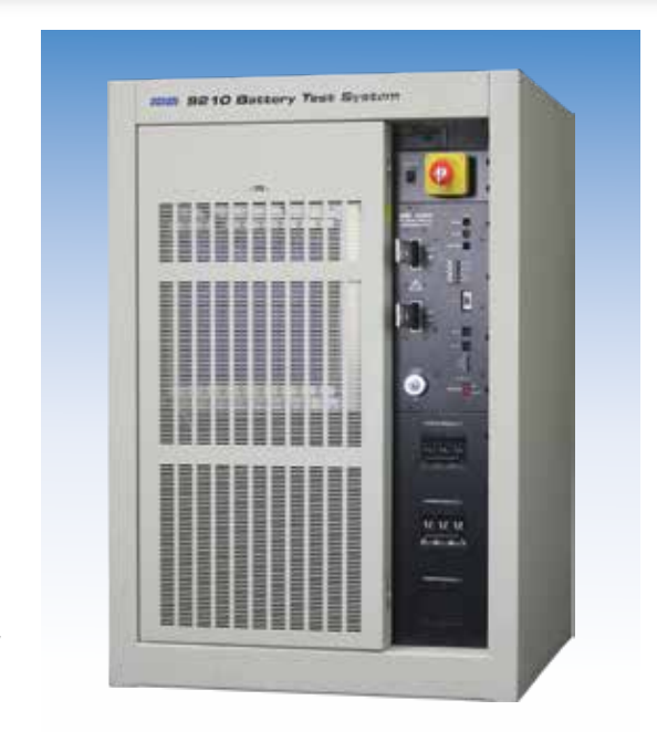
9210 Single Channel Test System

The 9210 Series test system is a single channel version of the popular 9200 family of test systems. The small footprint makes it easy to move within engineering or manufacturing environment thereby allowing it to be brought to the unit under test (UUT) or into an engineers workspace.